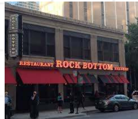
Rock Bottom Brewery 1 West Grand Chicago, IL

Meet fellow Project Management leaders in a fun and relaxed setting.